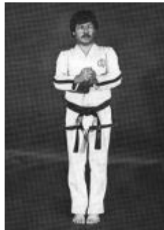
Close ready stance B toward D.