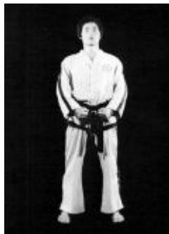
Parallel ready stance toward D.