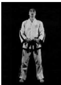
Parallel ready stance toward D.