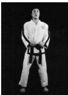
Parallel ready stance toward D.